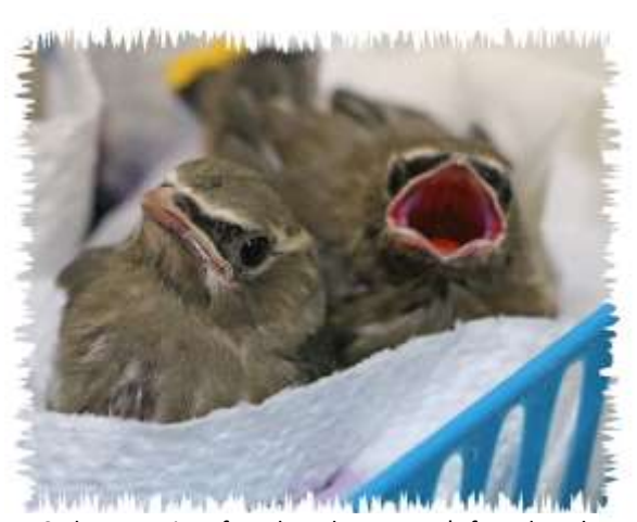
Cedar Waxwings found on the Rescuer's front lawn!

If you would like to help save birds but can't schedule time at WBR, there is a way you can helpjoin our phone team! This group responds to members of the community who call WBR when they have found a bird in distress. The phone team answers the call from home or anywhere they have cell service! Birds range from adults dazed after a window strike to abandoned hungry nestlings. You will discover by answering phones for WBR how caring and kind people are and how grateful they are for the guidance the team offers.