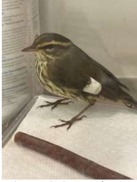
Northern Waterthrush recovering from a wing fracture.

Since January 1 we have received over 16,000 phone calls. Calls come from all over the state of Missouri, throughout the US and even some international calls. During our busiest months of May through August our 18 dedicated phone team volunteers answer hundreds of calls a day, 7 days a week. Each call is unique. The