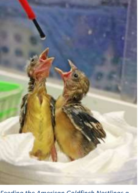
Feeding the American Goldfinch Nestlings a protein blend.

Winter patients are victims of the weather and a limited food supply. Another common occurrence is conjunctivitis which is primarily found in finches (House and American Goldfinch). It is a highly contagious infection that results in red, swollen eyes and heavy ocular discharge which severely