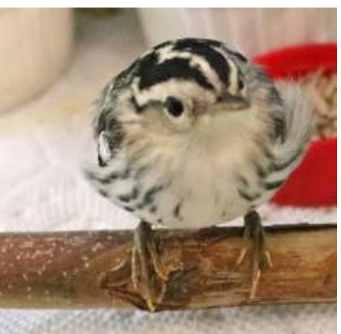
Black & White Warbler recovering from a collision during migration.

Cats are the main causes, but dogs are culprits too. Cornell Lab estimates "there are 60 million to 100 million freeranging. unowned cats. These are nonnative predators that, even using conservative