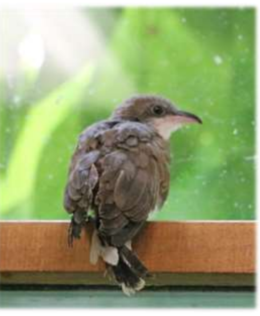
Yellow-billed Cuckoo Nestling